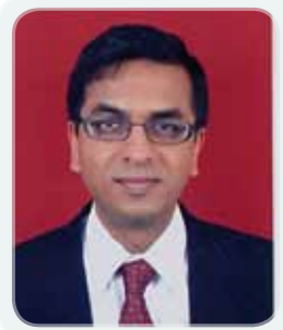
Dhananjaya Y Chandrachud